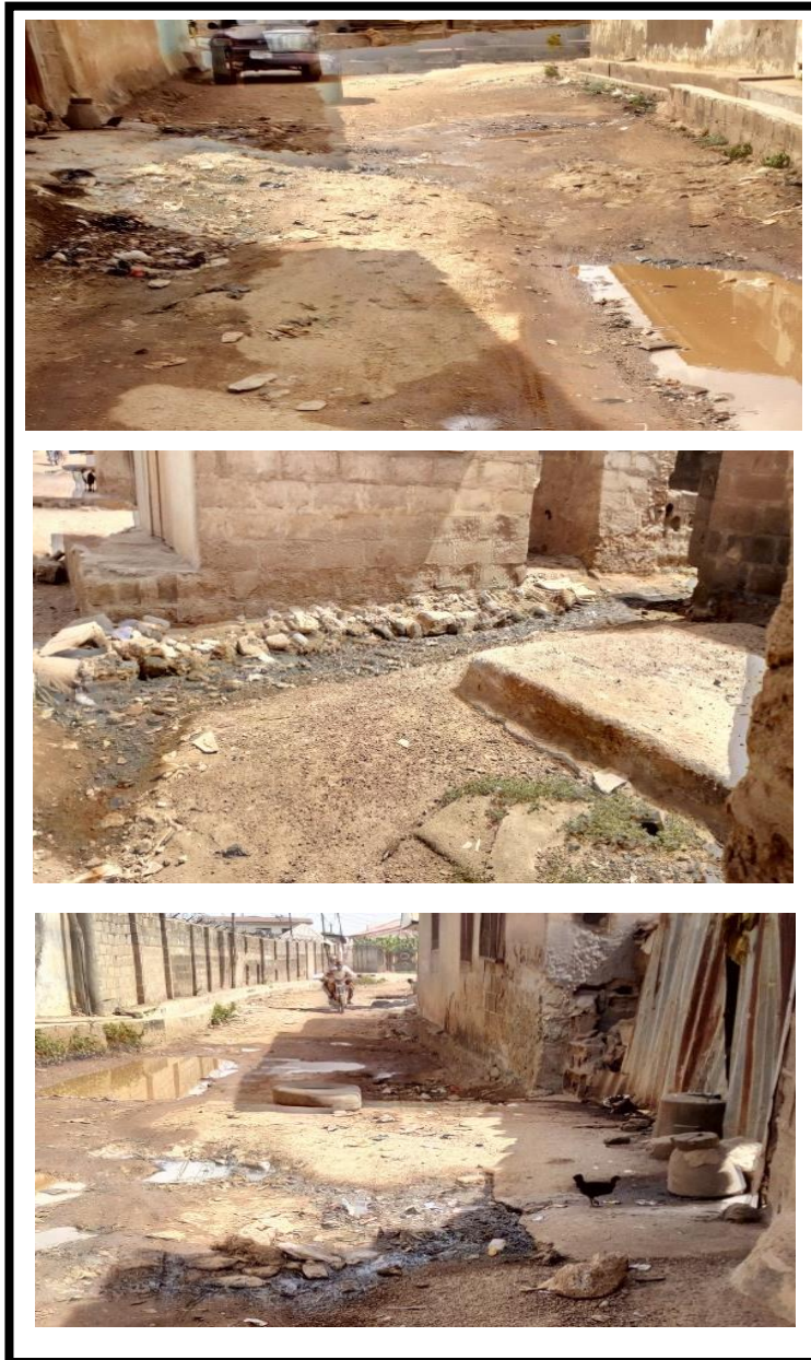
Fig. 4: Domestic Wastewater Disposal Problems in the Study Area

household heads was used in evaluating the influence of economic condition on wastewater management practices in the study area. Table 2 shows the result of household family size.