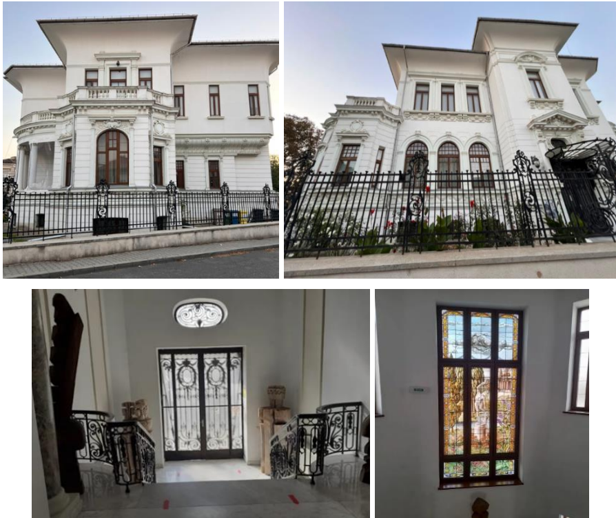
Figure 2. Exterior of Embiricos House

It is an open house. In the social area it is ample and well articulated in the assembly of the house, seeming to invite communication.