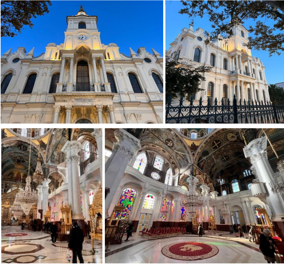
Figure 3. Greek Church interior and exterior (personal source)