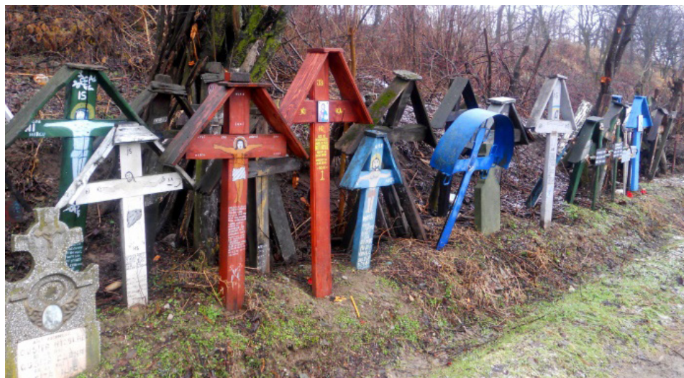
Fig. 7 Oath crosses

it is a memorial cross that is placed on the side of the road for passersby to remember the one who passed away ( fig. 7).