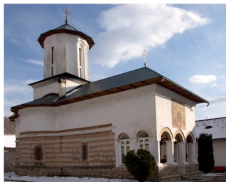
Fig. 4. Polovragi Monastery Church