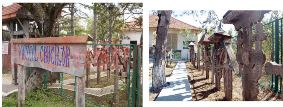
Fig. 6. Museum of crosses - Gorge with the four meanings: material object, symbol, power and sacrifice

The rural settlements in the Subcarpathian area of the Gorj also offer other types of cultural elements specific to the sacred cultural landscape, such as crosses. These have special meanings, and it is the village world that maintains and enhances them so that even those who do not know their meaning can find out these very interesting details: the four meanings: material object, symbol, power and sacrifice (fig. 6 ). The museum is the one that has the quality of keeping and providing information to those interested about any category of objects. In this case, the Museum of Crosses is the one that collected, preserves and provides information about these Christian symbols, thus offering a series of opportunities in knowledge.