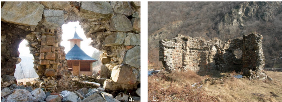
Fig. 1. Ruins of Visina Monastery, Gorj county

Their age is also relevant, so many tourists or visitors are attracted by their age, the materials used, the technique used. In this sense, we analyzed the behavior and attractiveness offered by the ruins of the Visina Monastery (fig. 1 a and fig. 1. b)