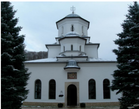
Fig. 3. Tismana Monastery Church

In this sense, the discussions held with those who visited them, had as a central element “faith” (fig. 5). This feeling is offered precisely because of the religious activity for which most of those who end up visiting them are for religious services or for other services of a religious nature.