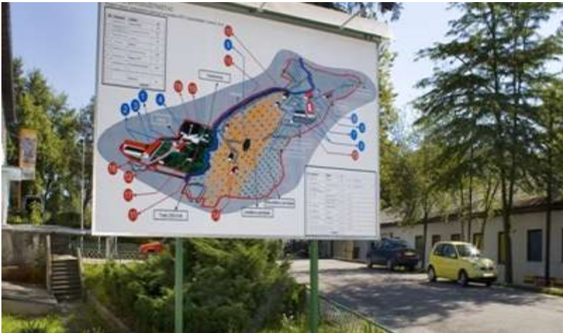
Figure 5 Map of DEC

As stated above, within the Centre operates 30 companies (Figures 2, 3 and 6) from different sectors and that despite that fact they have very good cooperation and persist for a long time with a positive performance, which can be concluded on the basis of a stable number of employees.