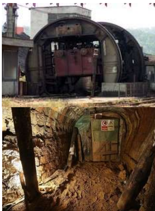
Figure 1 Closed Mine 'Lipnica'

complete and permanent suspension of all works related to coal exploitation in that area. After closure of the mine 'Lipnica', out of order remained the entire infrastructure that constitutes a large complex. The complex offers great opportunities for the development of different types of entrepreneurial activity with a high degree of flexibility of use of the available space. The complex 'Lipnica' contains 29 buildings constructed area of 14-3100 m 2 and a total area of around 10,933 m 2 and a land area of 158,770 m 2 . Through complex flows unregulated stream Joševica. All facilities within the complex are connected by asphalt roads, so it's easier access from all sides.