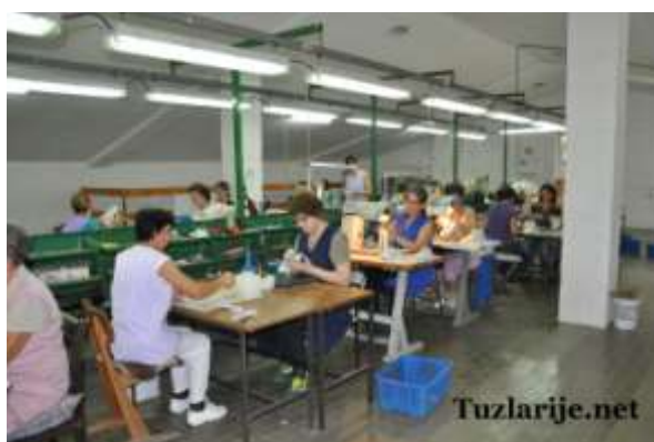
Figure 3 New jobs within the DEC

The primary goal of incubation center is better support to new and existing enterprises for accelerate the development of entrepreneurship, job creation, problem solving redundancy, increase the tax base, reconstruction and further use of existing facilities, improving infrastructure, and creating the image of the community as a center for innovation and entrepreneurship.