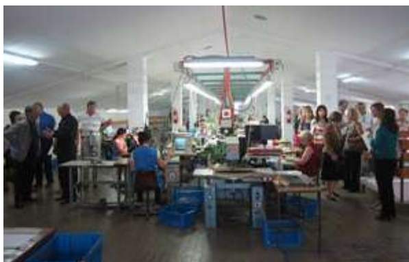
Figure 2 Part of the Developmentally-Entrepreneurial Center Tuzla

Adaptation part of facility in Developmentally-Entrepreneurial Center Tuzla - Incubator Lipnica was carried out in order to strengthen the capacity of local service providers and creating opportunities for business incubation, in the framework of the project 'Innovative networking and economic cooperation between Tuzla and Vukovar' (InECo), which is financially supported by the EU and co-financed by Tuzla Municipality.