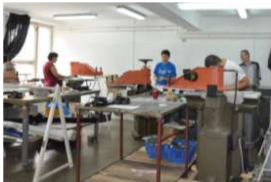
Figure 6 The entrepreneurial firm at DEC

Exactly a wide range of end products offered by this company provides a positive example of engagement of the authorities towards improving production and service activities. These products are to place in the area of Tuzla Canton and beyond. The products have gained recognition and influence the overall image of Bosnia and Herzegovina.