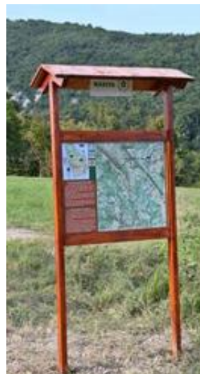
Picture 3b. The look of the board at the foothill of the mountain Stol

Associations Eko Baština, Village and Young Researches of Bor, conceived and started Realization of " Bor's Green Oases" project, for the sake of marking the route E4- European Walking road in Bor territory, and also for the sake of logging accomodation conditions and provision of tourist services near and on the route. The results of this project should be: