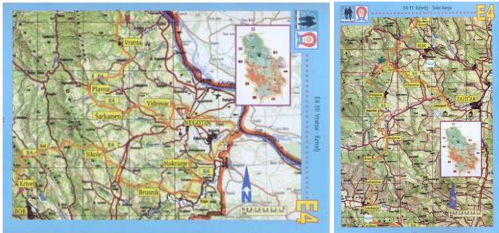
Picture 2 Route E4 in Bor's territory

In East Serbia ,E4 comes in near Golubac and goes out on Stara Planina. In Bor territory it comes in over the mountain Deli Jovan, goes over Stol and Veliki Krš, Lake of Bor, Brestovac spa, Lazar's cave and canyon and over the Malinik goes over on Boljevac territory to Rtanj.