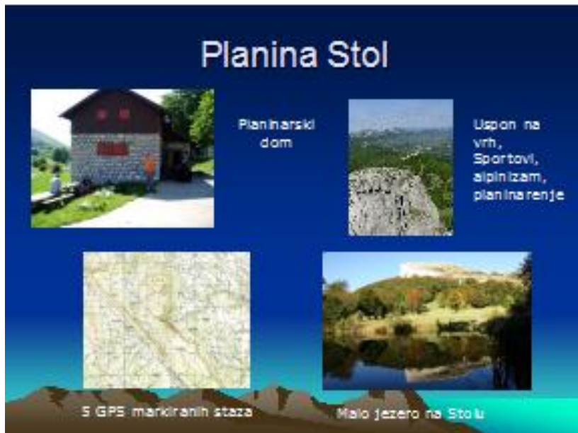
Picture 4a. Mountain Stol and its touristic potentials

Association of Bor's Young Explorers did a special survey of rural households in the area of mountain Stol and Veliki Krš, which was basic to develop a safety study of Stol. Survey participants showed great motivation for village tourism, with different activities, like producing healthy food, developing traditional and cultural manifestation.