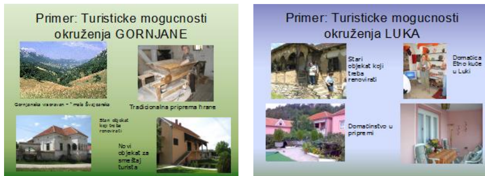
Picture 4b and 4c. The potentials of village tourism